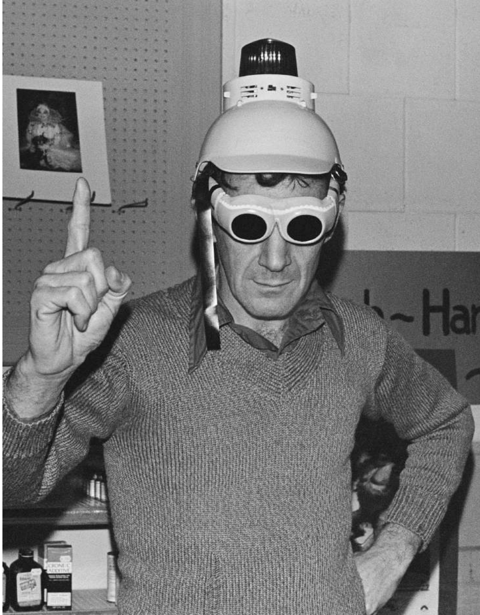
Harvey Milk clowning around at the Castro Camera store, 1977