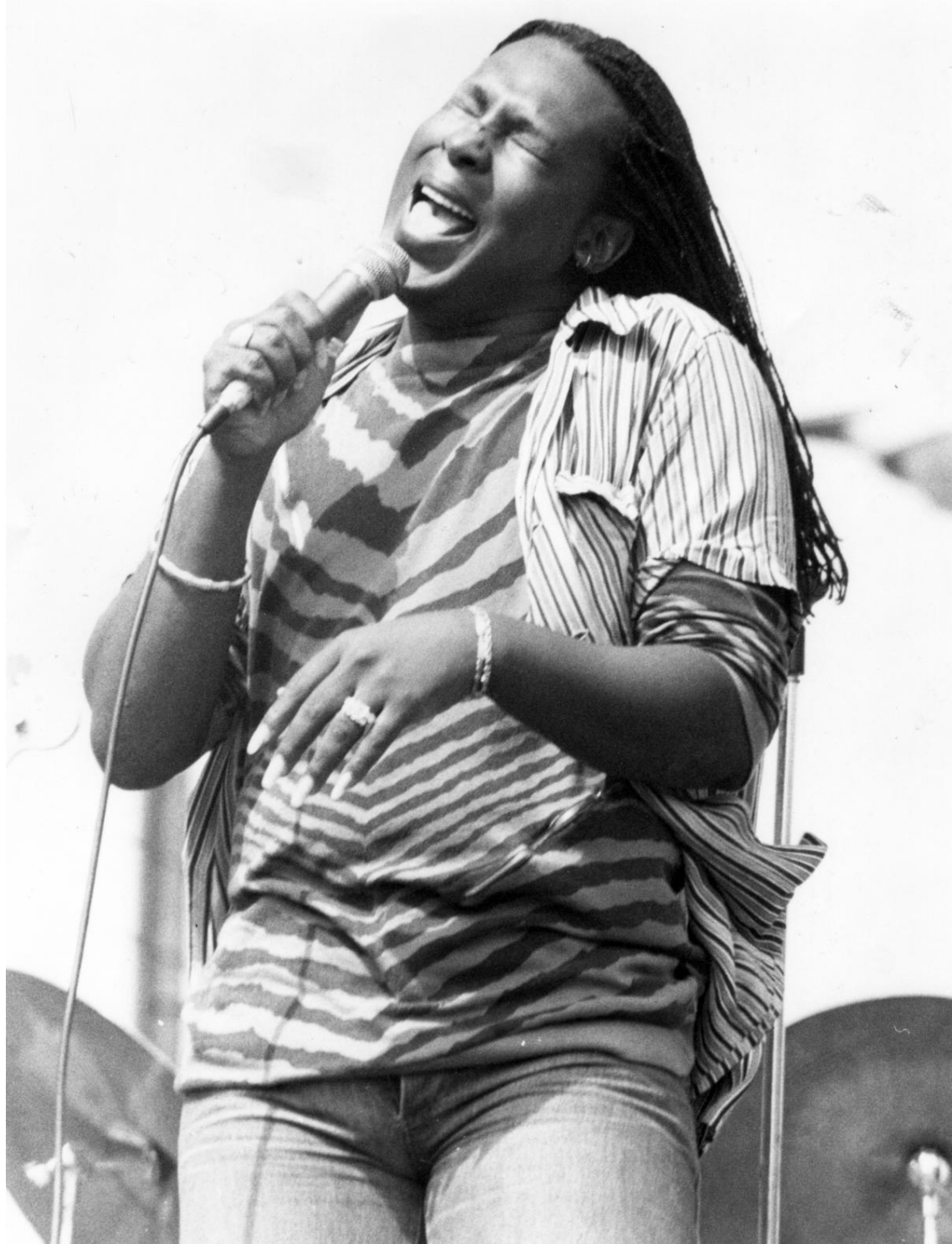
Sylvester sings at the Castro Street Fair, ca. 1980

The GLBT Historical Society | (415) 777-5455 | info@glbthistory.org | www.glbthistory.org