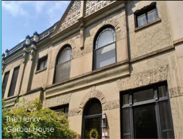
The Henry Gerber House