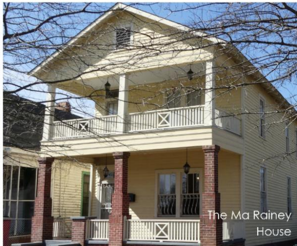
The Ma Rainey House