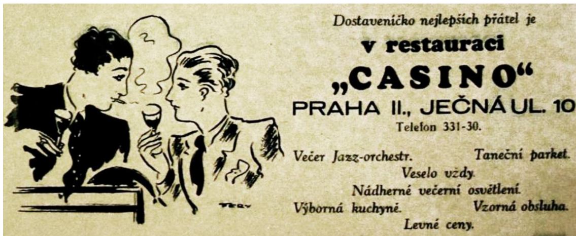
Advertisement for Casino Restaurant in Prague, an LGBTQ gathering place in the 1930s.