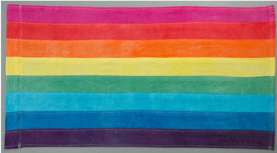
A rainbow flag sewn by Gilbert Baker; photo courtesy of the Gilbert Baker Estate.