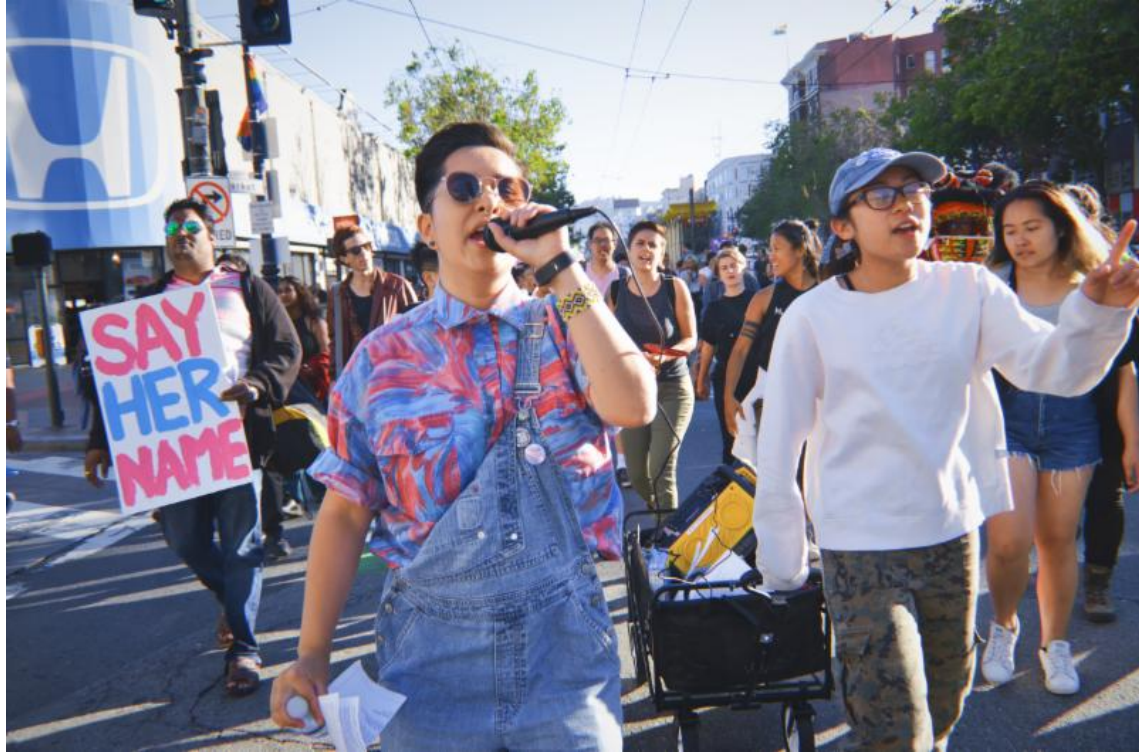
API Equality — Northern California chanting during the San Francisco Trans March (2018).

The GLBT Historical Society | (415) 777-5455 | info@glbthistory.org | www.glbthistory.org