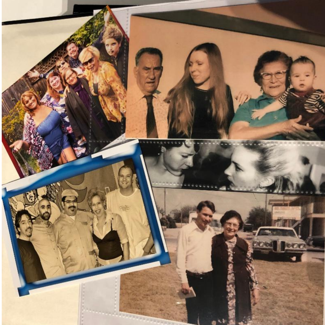
One of the pages in the family albums displayed in the exhibition “Chosen Familias : Bay Area LGBTQ Latinx Stories,” now on view at the GLBT Historical Society Museum; photograph by Nalini Elias.

September 19: In Search of Stonewall Book Launch