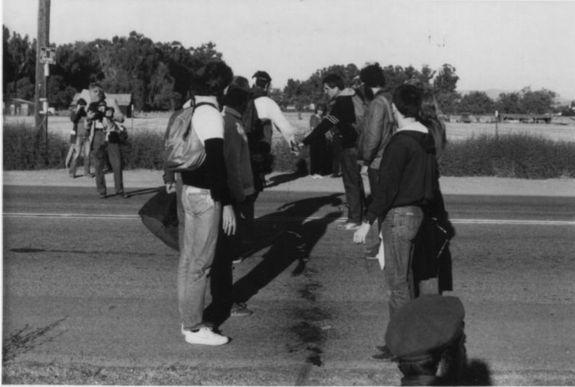
Members of the gay men's affinity and antinuclear group Enola Gay pour blood on the road outside Lawrence Livermore National Laboratory, September 24, 1984; photo by Jack Davis, used with permission.

September 26: The Ventriloquists Book Launch